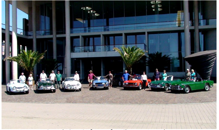
Triumph Cars in front of Freiburg Konzerthaus

was the perfect place to discover the Black Forest. If you have never visited this part of Germany you should as it is very beautiful. The weather was warm and sunny as we discovered the lakes of Titisee and Schluchsee, the waterfalls at Todtnau, the villages of St Peter and