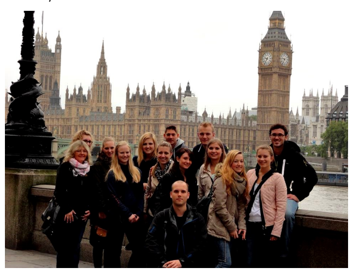
Max Weber Schule interns visit London

On Wednesday we had the great opportunity to join our exchange partners through their school day and attend British lessons. We were surprised to learn that those are not very different from our lessons in Germany. But the school rules couldn't be more different. None of us