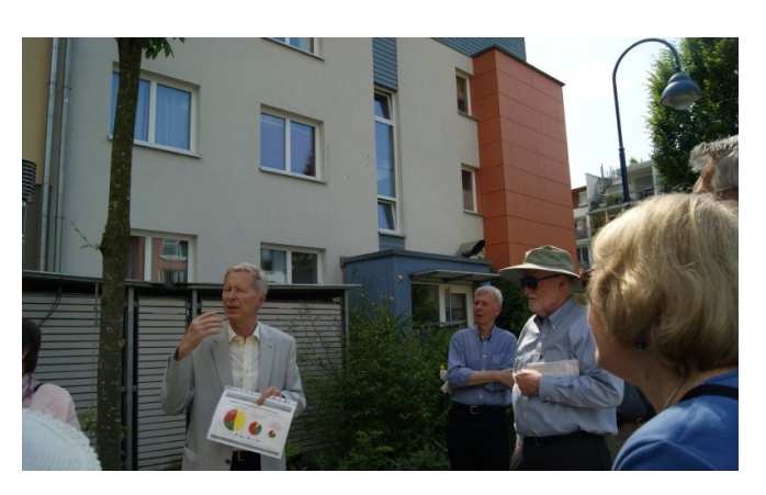
Vauban, with Solarsiedlung or "plus energy houses" (top)

and fruit trees and hives. Between some of the flatted buildings [sic] there were gardens for the ground floor units but these were never fenced in or enclosed in the way one would expect in a British housing development: the vegetation, flowers, play equipment all drifted naturally into a communal area around the buildings. There were clearly few boundary disputes here.