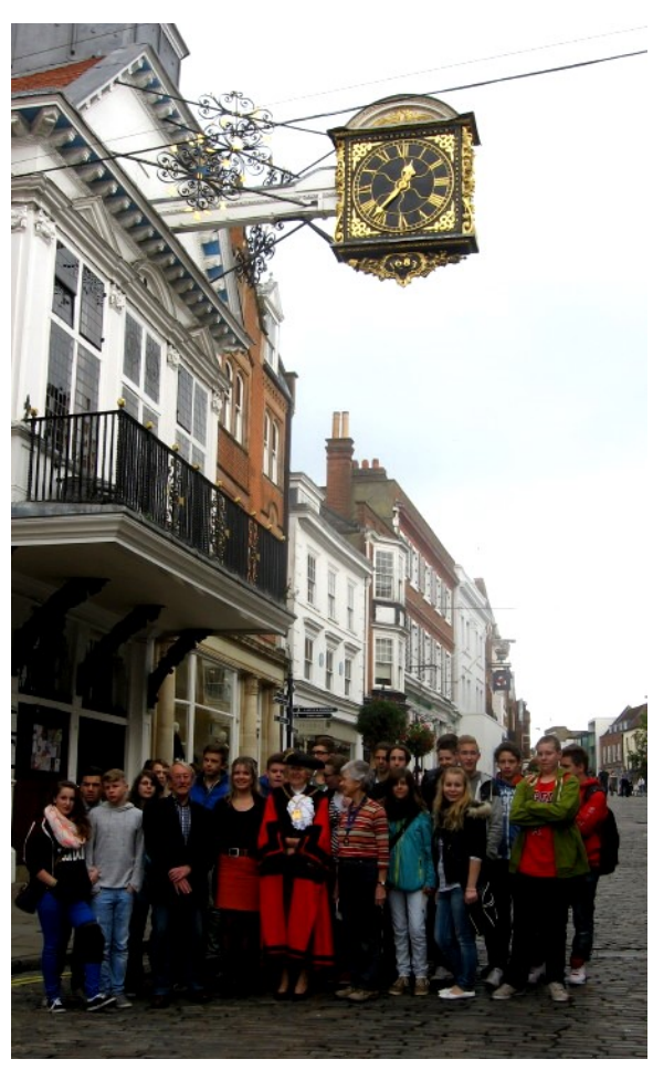
Karlschule visit with Mayor (robed) in Guildford High Street

are a great example of how the younger generation play a part in fostering the links between Guildford and Freiburg".