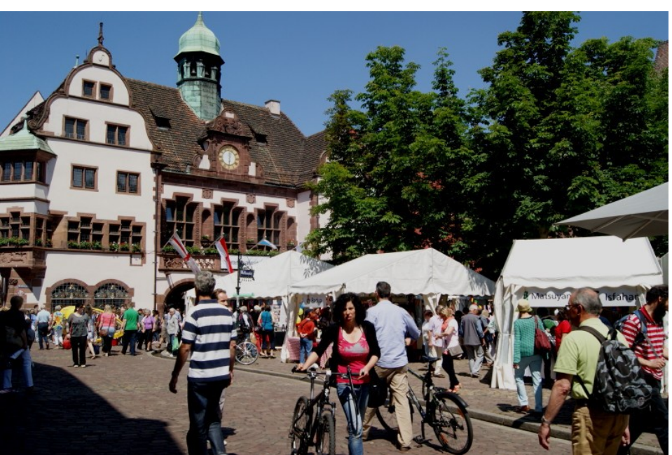
Rathausplatz and Partner Cities Market

Very much consistent with the ideas expressed in my first paragraph is the Partner Cities Market run by Freiburg City Council, involving its