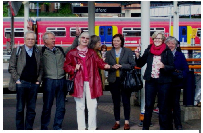
Churches Link visit: Freiburg group at Guildford station

Food was a necessary highlight of the programme. We would like to thank any hosts, church officials or committee members reading this for coping so well – our German visitors were very impressed. The farewell meal at St Mary's was a triumph, not one portion nor potato remained and Shalford puddings lived up to their fine reputation; this followed the Eucharist.