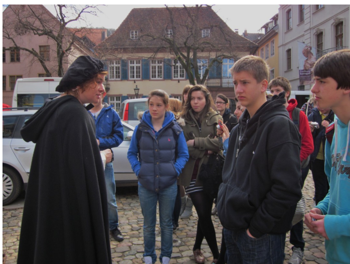
George Abbott students with Freiburg town guide (see item right)

Then in July our partners and their teachers from the Goethe Gymnasium in Freiburg came to stay with the George Abbot students who had participated in the German exchange. The German students had a guided tour of Guildford, a bus trip around central London, a day out in Brighton and spent the weekend with the English students.