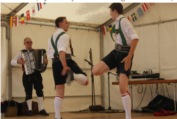
The Austrians (in fact Innsbruck) danced