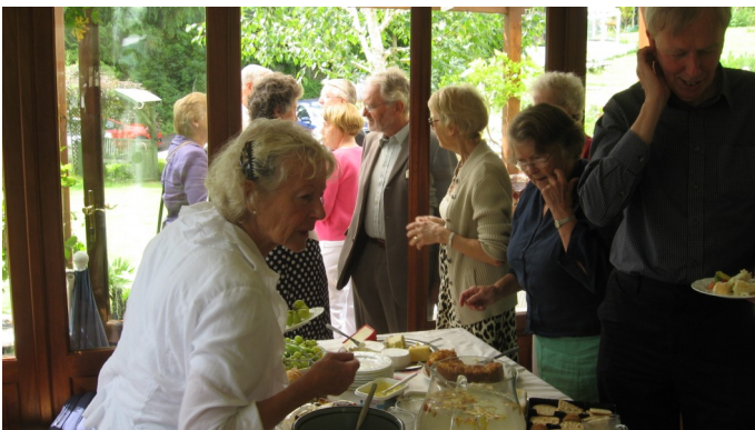
The food was so good it was hard to choose..

For a change, the 2012 summer lunch party will be held at Cobham Park, rather than in a private home. Details to follow.