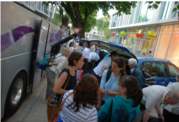
Church group arriving in Freiburg