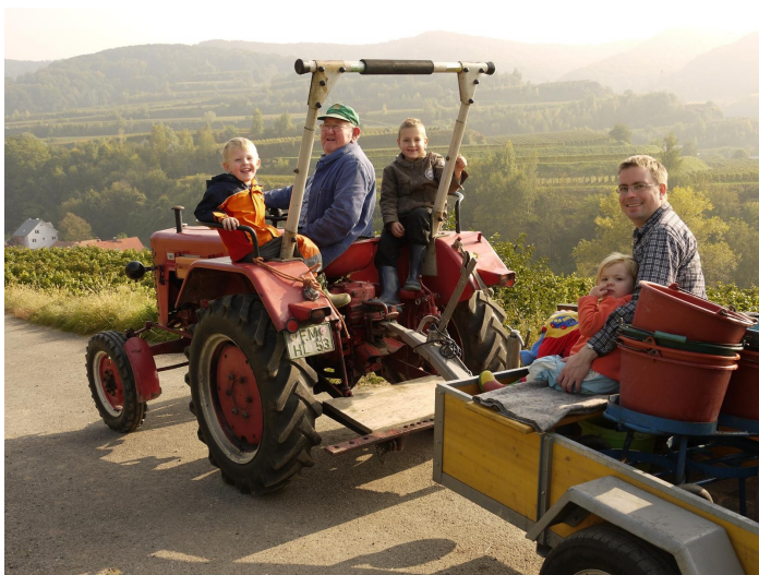
Family setting off for the grape harvest