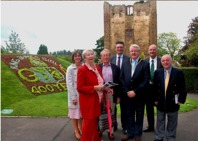
Below left: In Guildford Castle grounds with guide