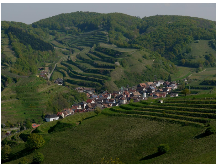
Village of Schelingen in the Kaiserstuhl

his very beautiful and atmospheric pictures of the landscape, wild flowers, orchards and, of course, the vineyards. The wines included Grauburgunder, Weissherbst and Spätburgunder from the Tuniberg near Freiburg; a Gewürztraminer from Ihringen in the Kaiserstuhl and two wines from Durbach, a pretty village near Offenburg, famed throughout Germany for the Rieslings grown on its flinty soils. David gave a brief introduction to each wine as it was poured and tasted, and had brought examples of the crumbly loess rock deposited during the glacial period over the Rhine valley, which enabled vines grown