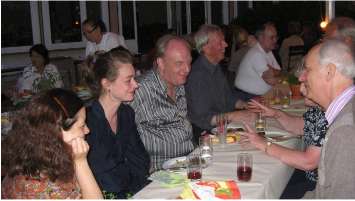
At the welcome party