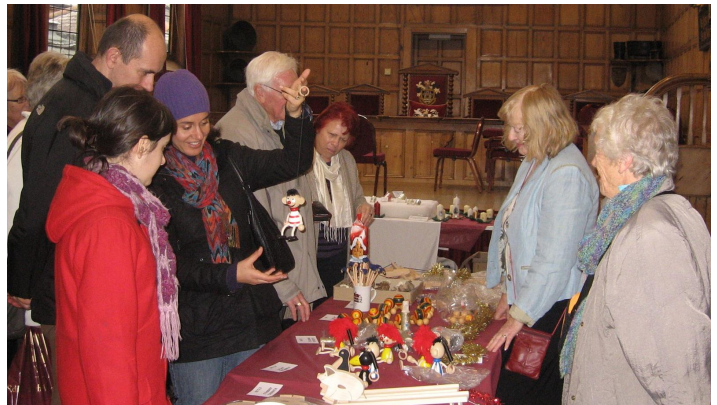
Stall with Freiburg toys

Once again, on the last Saturday in November, Guildford's historic Guildhall was filled with the aroma of Glühwein and rang with the