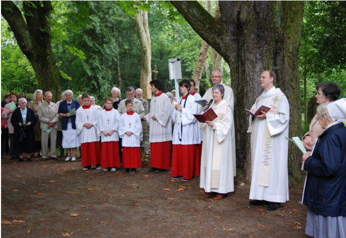
Ascension Day Service at Ludwigskirche

What I particularly like about these regular bi-annual exchange visits with Christians in Freiburg is that they 'have everything': fellowship and fun with those whom we now regard as firm friends, worship in wonderful settings often accompanied by remarkable music, and study of a chosen topic that we, as fellow Christians, regard as important to our faith. This time the theme for our visit to Freiburg was 'care for those in need', and we tackled it both theologically – in Bible study; liturgically – it featured in much of our worship; and practically – in a number of visits we made to projects in Freiburg designed to bring effective support to the needy and disadvantaged. We were impressed by what is being done in Freiburg, and heartened by the high degree of Christian