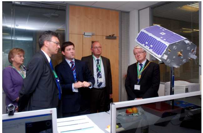
At Surrey Satellite Technology Ltd