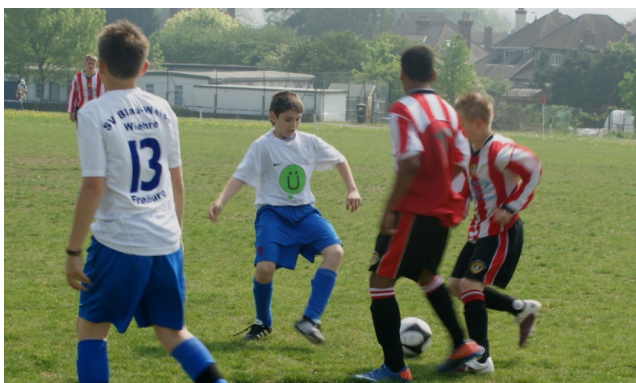
Action shots of various matches (left and centre right)