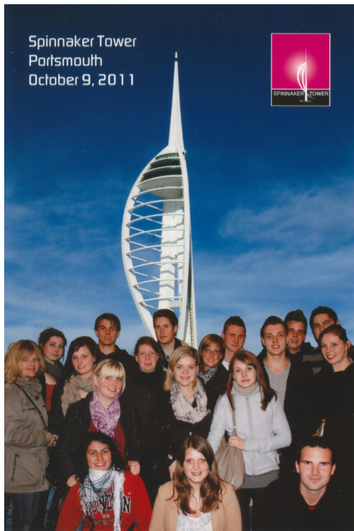
The Max-Weber-Schule group in Portsmouth

The aim of the stay in England was to let the students gain insight into English working life accompanied by tutoring and lessons provided by the Guildford College of Further and Higher Education. Each of the seventeen students has been working in a company which was located in Guildford or the surrounding area. During their internship