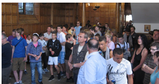
Teams and supporters at Guildford reception