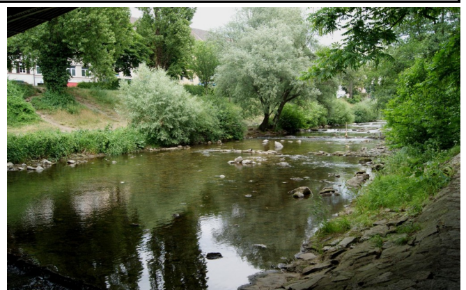
Freiburg's river Dreisam