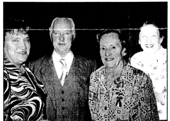
Four of the people who have helped towards the success of the association over the years:

In this first Guildford-Freiburg Association newsletter we feature some of the organisations that have helped to make the link so successful and by doing so hope to encourage other groups and individuals to play an active part in building up further contacts with our twin town in the Black Forest, one of the most beautiful regions of Germany.