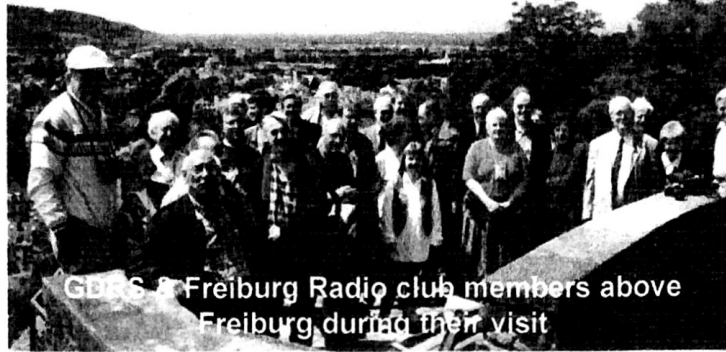
GDRS & Freiburg Radio club members above Freiburg during their visit